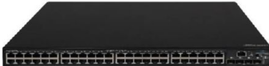
HPE Networking Comware 5140 48G PoE+ 4SFP+ EI Switch (JL824A)

High availability, simplified management, and comprehensive security control policies are among the key features that distinguish this series.