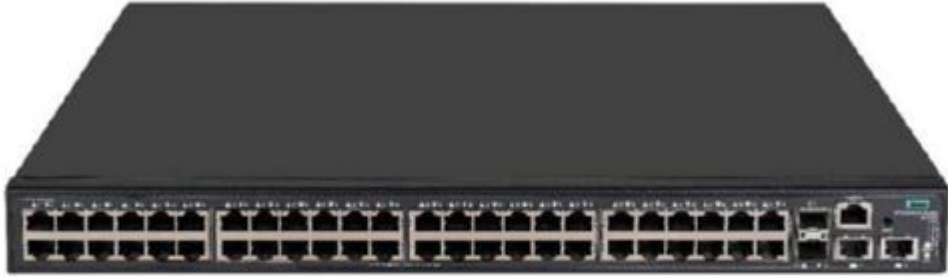
HPE Networking Comware 5140 48G PoE+ 4SFP+ EI Switch (JL824A)