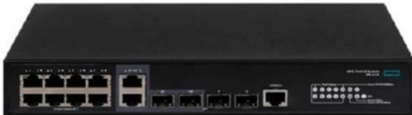
HPE Networking Comware 5140 8G 2SFP 2GT Combo EI Switch (R8J42A)