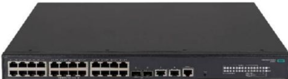
HPE Networking Comware 5140 24G POE+2SFP+2XGT EI Switch (JL823A)