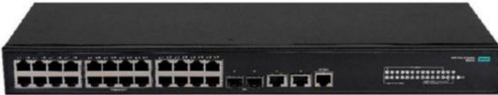
HPE Networking Comware 5140 24G 2SFP+ 2XGT EI Switch (R8J41A)