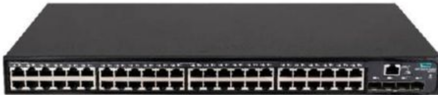
HPE Networking Comware 5140 48G 4SFP+ EI Switch (JL829A)