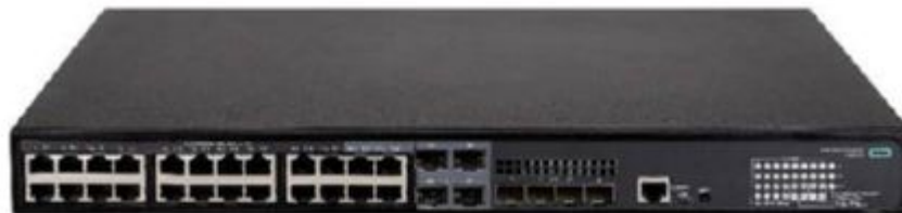
HPE Networking Comware 5140 24G PoE+ 4SFP+ EI Switch (JL827A)