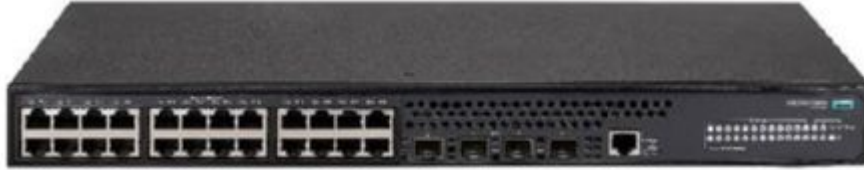
HPE Networking Comware 5140 24G 4SFP+ EI Switch (JL828A)